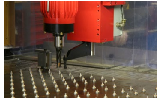
Quickmill's Patented Hydraulic Pressure Foot

Call us for more information: 1-800-295-0509