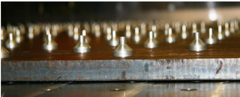
Quickmill's Patented Aluminum Support Pins

The working stroke of the Pressure Foot is 3" (76 mm) and is hydraulically activated and controlled through the part program during canned cycles. It applies 2000 lb. (908 kg) of force on the surface of the workpiece using hydraulic pressure from a dedicated hydraulic system.